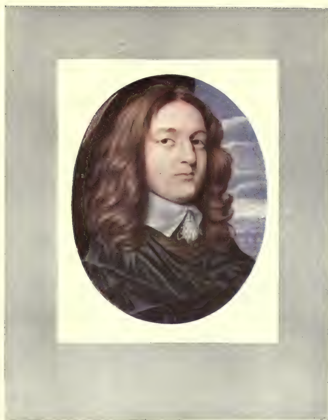
THE DUKE OF BUCKINGHAM BY JOHN HOSKINS, THE ELDER